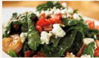
Spinach & Shrimp Salad

LITE RANCH, HONEY FRENCH, BLEU CHEESE, HONEY MUSTARD, THOUSAND ISLAND, FAT FREE GOLDEN ITALIAN, BALSAMIC VINAIGRETTE