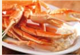
Snow Crab Legs