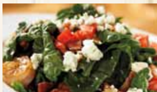
Spinach & Shrimp Salad

LITE RANCH, HONEY FRENCH, BLEU CHEESE, HONEY MUSTARD, THOUSAND ISLAND, FAT FREE GOLDEN ITALIAN, BALSAMIC VINAIGRETTE