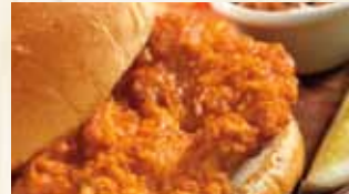
Buffalo Chicken Sandwich

BUFFALO CHICKEN - 8.59 A JUICY CHICKEN BREAST MADE JUST LIKE OUR WORLD FAMOUS WINGS; BREADED AND TOSSED IN YOUR FAVORITE WING SAUCE.