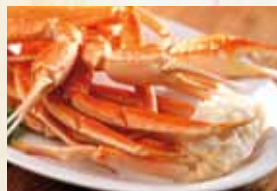
Snow Crab Legs