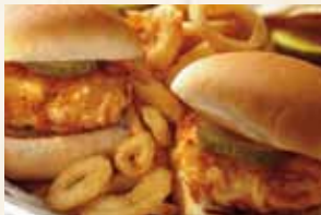
Buff Chick Sliders